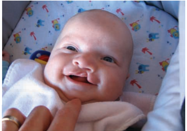
My lovely smiley baby