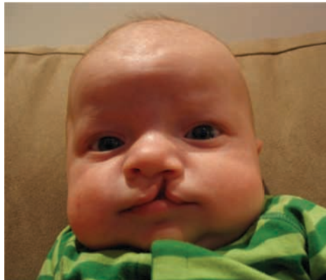
Three months old